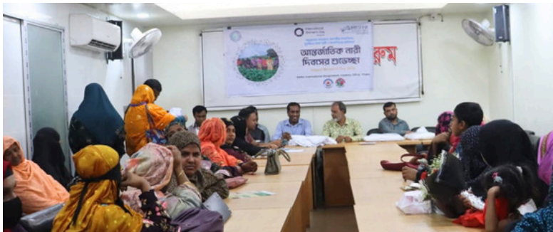
BD-17 (climate smart vegetable & flower) Project hosted Rally & Meeting