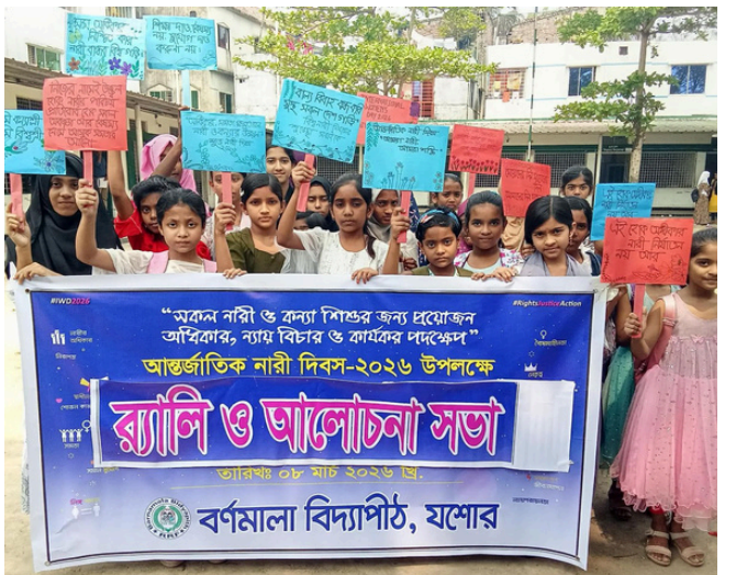
Barnamala Bidyapith Celebrates International Women's Day 2026