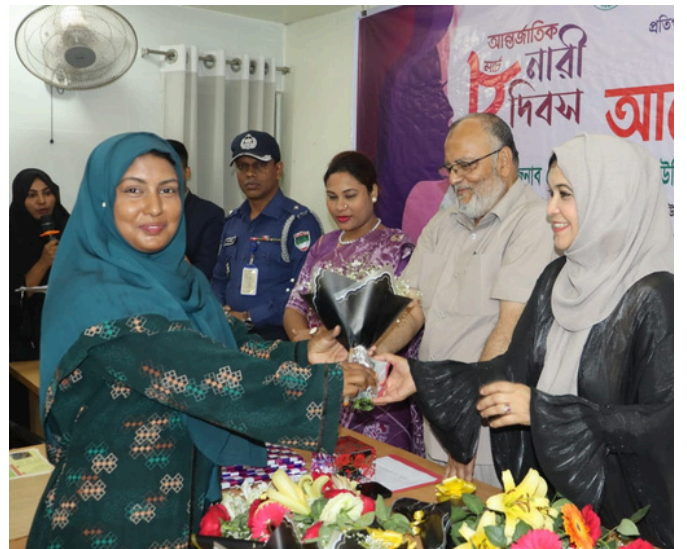
"SMART Project were specially recognized and awarded it's ME's to Celebrates Women's Empowerment at RRF"