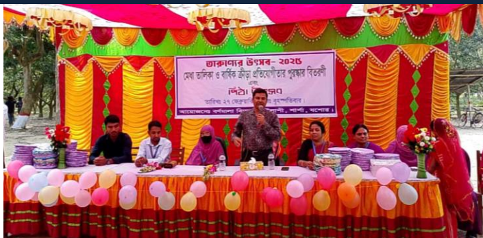
BBP Bahadurpur School celebrated Annual sports prize giving and Pitha Festival