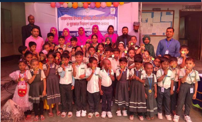
BBP Ulashi School celebrated Annual sports prize giving and Pitha Festival